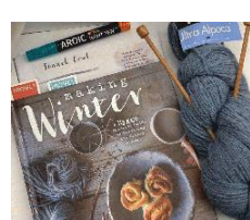
Take & Make Kits